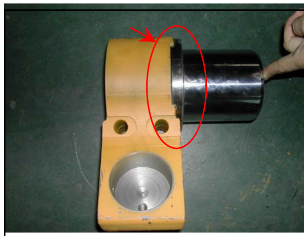
Fig. 3 Assembly of swing lever and wear sleeve