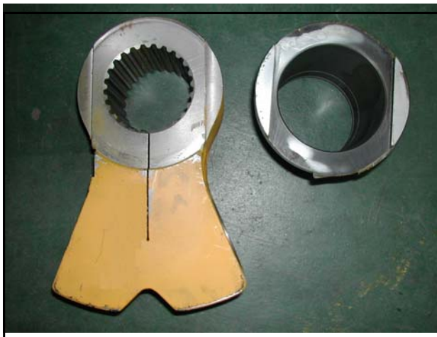
Fig. 1 New swing lever (Grooved)