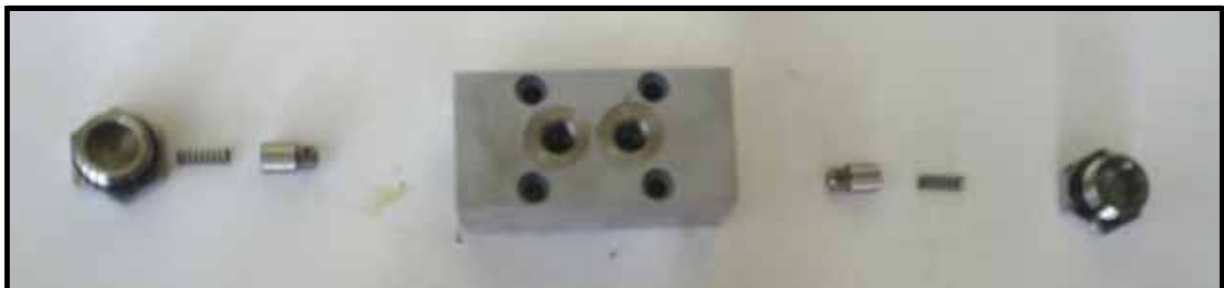
outrigger check v/v disassembly and expander type check v/v.